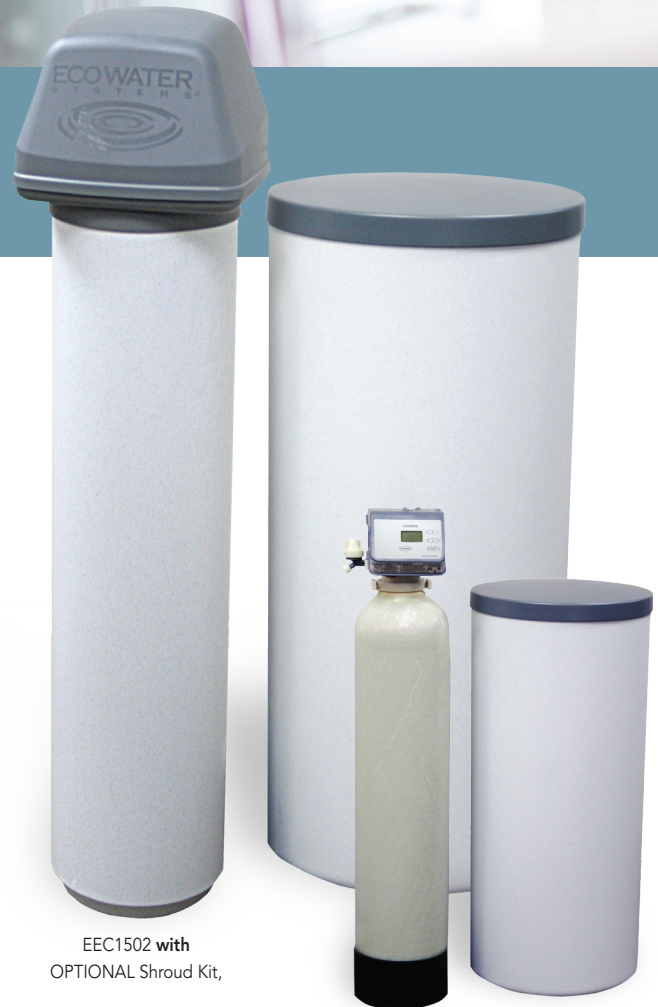
EEC1502 with OPTIONAL Shroud Kit,

ECOWATER 1500 SERIES – ECONOMICAL WATER CONDITIONERS