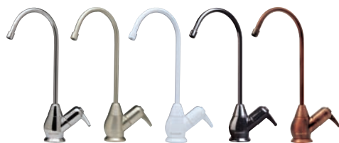
Chrome Brushed Nickel White Black Oil-Rubbed Bronze

Simply return your used RO cartridges to your local EcoWater Dealer and we'll do the rest.