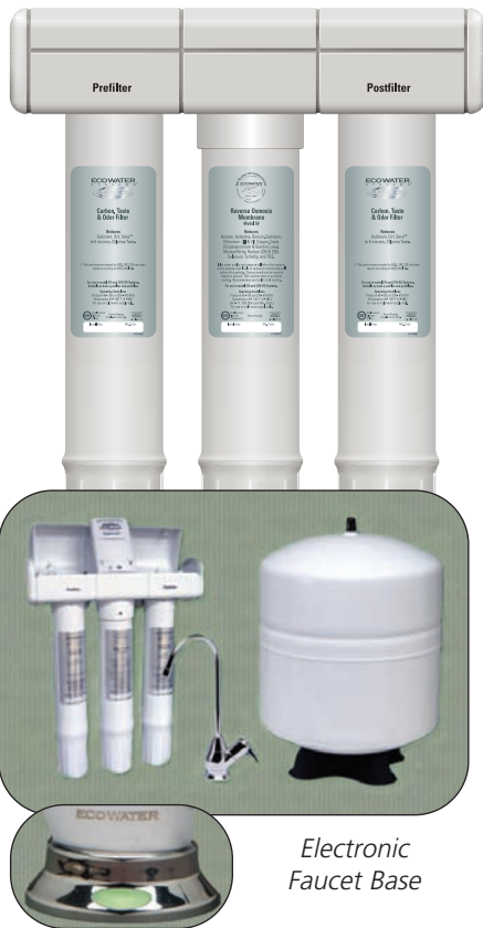
Electronic Faucet Base