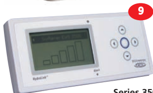
Series 3500 HydroLink™ Remote

FCC Tested to comply with FCC Standards IC3590A-7695.