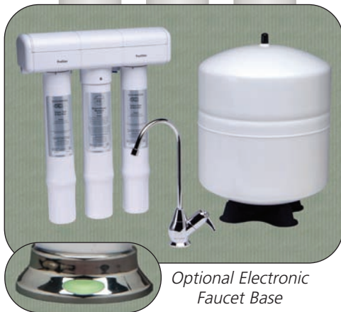
Optional Electronic Faucet Base